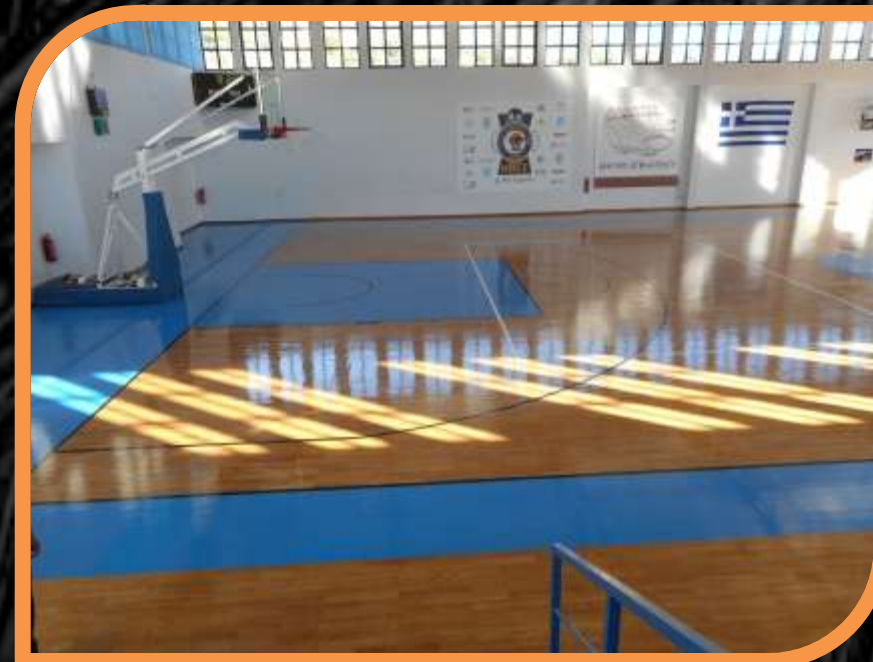
LYGOURIO INDOOR SPORTS HALL

https://maps.app.goo.gl/ovNeUT4ZBaC8tyKe6