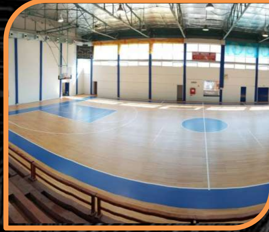
NAFPLIO INDOOR SPORTS HALL

https://maps.app.goo.gl/Nmtesip2FqzryVSv6