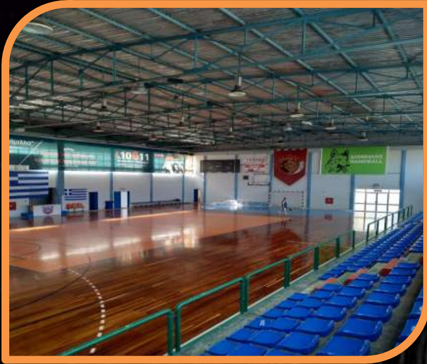
ARGOS INDOOR SPORTS HALL