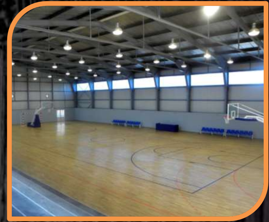
N.KIOS INDOOR SPORTS HALL

https://maps.app.goo.gl/XEVr4LVqdhHjyt8R7